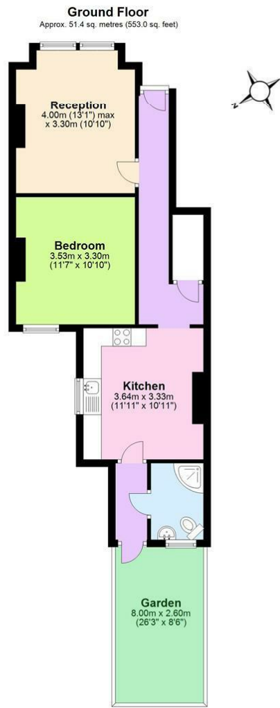
Total area: approx. 51.4 sq. metres (553.0 sq. feet)